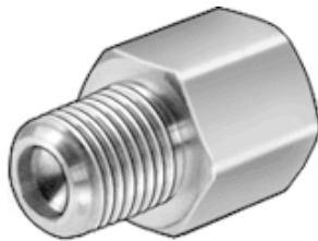
Figure 1: 0.07" Orifice

If heaters prior to the above serial numbers are experiencing frequent flame faults and/or making popping sounds, add a restrictor (#2333, 0.07" orifice) to the fuel return line in order to create a positive fuel pressure on the regulator assuring a constant supply of fuel to the nozzle. The restrictor can, as show in the example below, be placed anywhere in the fuel return line close to the heater.